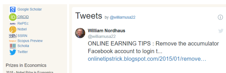
Fig 4. Other author profiles and Twitter timeline

Besides the presented features, the list of results could be filtered and sorted using several criteria, through the interactivity in the area 3a.