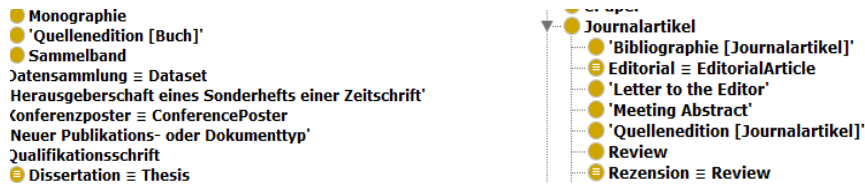
Fig. 3: Publication-related classes in the first version of the kdsf-vivo-alignment.owl

Fig. 3 illustrates the equivalences and subsumptions stated between the classes of the VIVO ontology and KDSF. As shown in Fig. 3, we have omitted the KDSF intermediate categories kdsf:Publikationstyp (English: “publication type”) and kdsf:Dokumenttyp (English: “document type”), since the categorization of publications in VIVO is already done by assigning categories to the types of documents without differentiation of form and content. Classes with a partial correspondence were inserted as sub-classes.