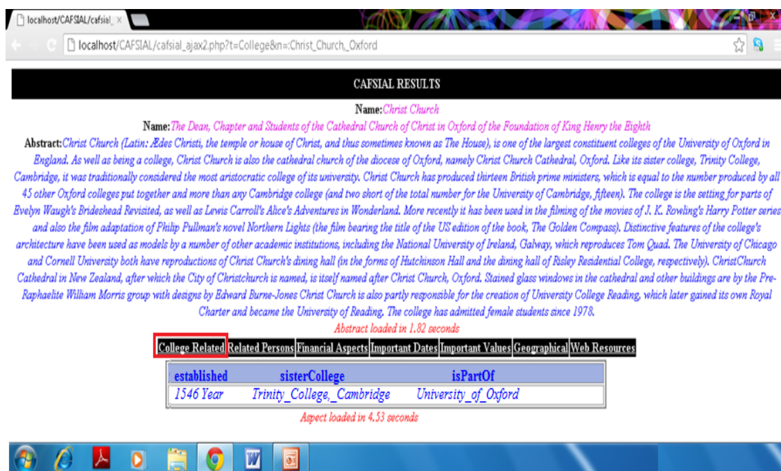
Figure 3. Screenshot of Result Presentation.

dump is being stored locally. This is notable improvement since the previous version of CAFSIAL was locally storing the DBpedia dumps. As the data is retrieved, at the same time similar properties are allied together to their relevant aspects using the already stored Domain and Range.