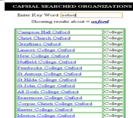
Figure 2. Screenshot - List of Suggested Organizations

The working of the automated CAFSIAL is explained in this section. CAFSIAL has a simple web based interface, and can be run in any of the web browser. User enters an organization’s name and related names are suggested by the system automatically. User enters the name or selects one form auto-suggested terms and searched button is pressed. Names of the organizations which match the user’s entered term are retrieved along the organization type and are displayed to user. For example, if user searches “Oxford”, he is provided with list of possible college (organization) resources to decide on as shown in figure 2.