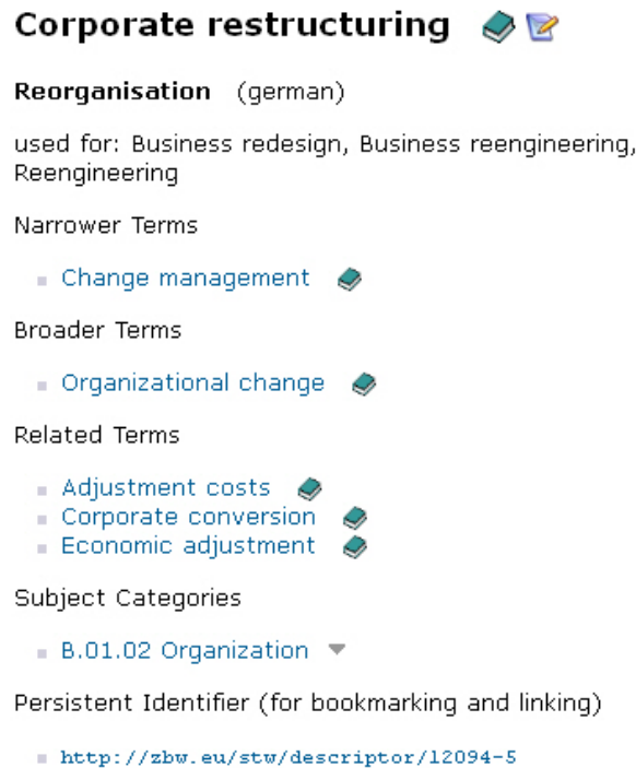
Fig. 2. STW Thesaurus for Economics concept, XHTML+RDFa representation

An example of a SKOS concept, as a human-readable XHTML page with embedded RDFa data prepared for use in the Semantic Web, and in its Turtle representation, is given in Fig. 1 and 2 (taken from STW Thesaurus for Economics 16 ).