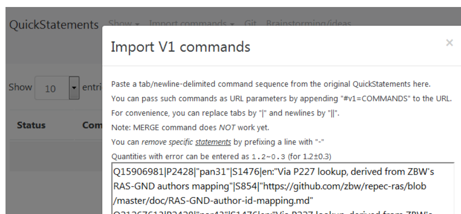
Fig. 2. Import statements for QuickStatements2 . The first input line adds the RAS ID “pan31” to the item for the economist James Andreoni. The rest of the input line creates a reference to ZBW’s mapping for this statement and so allows tracking its provenance in Wikidata

That step resulted in 384 added GND IDs to items identified by RAS ID, and, in the reverse direction, 77 added RAS IDs to items identified by GND ID. For the future, it is expected that tools like wdmapper 16 will facilitate such operations.