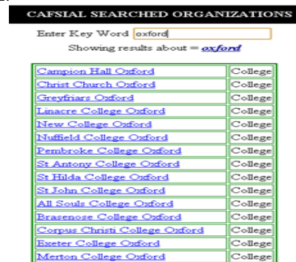
Figure 2. Screenshot - List of Suggested Organizations

The working of the automated CAFSIAL is explained in this section. CAFSIAL has a simple web based interface, and can be run in any of the web browser. User enters an organization’s name and related names are suggested by the system automatically. User enters the name or selects one form auto-suggested terms and searched button is pressed. Names of the organizations which match the user’s entered term are retrieved along the organization type and are displayed to user. For example, if user searches “Oxford”, he is provided with list of possible college (organization) resources to decide on as shown in figure 2.