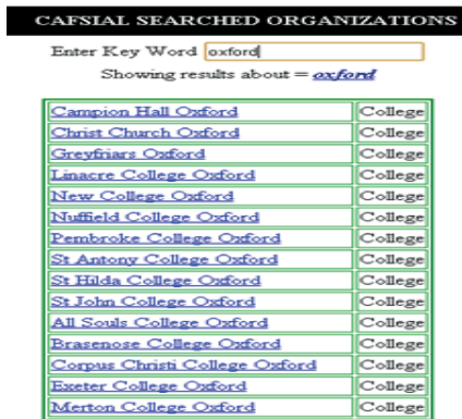
Fig. 2. Screenshot - List of Suggested Organizations

The working of the automated CAFSIAL is explained in this section. CAFSIAL has a simple web based interface, and can be run in any of the web browser. User enters an organization's name and related names are suggested by the system automatically. User enters the name or selects one form auto-suggested terms and searched button is pressed. Names of the organizations which match the user's entered term are retrieved along the organization type and are displayed to user. For example, if user searches "Oxford", he is provided with list of possible college (organization) resources to decide on as shown in figure 2.