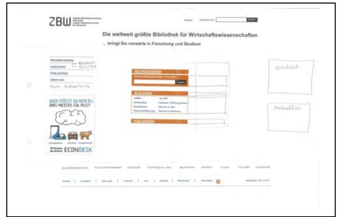
Figure 5. Typical example of the handicraft-task

In the following, only the frequencies for the Web 2.0 links are reported. The accordingly quantitative results of the advanced scribbling are listed in Table 1. The numbers show how many of the ten test persons marked the Web 2.0 links with the different colours. The participants were not forced to mark anything at all. Thus, the sum of green, yellow and red can be different from ten.