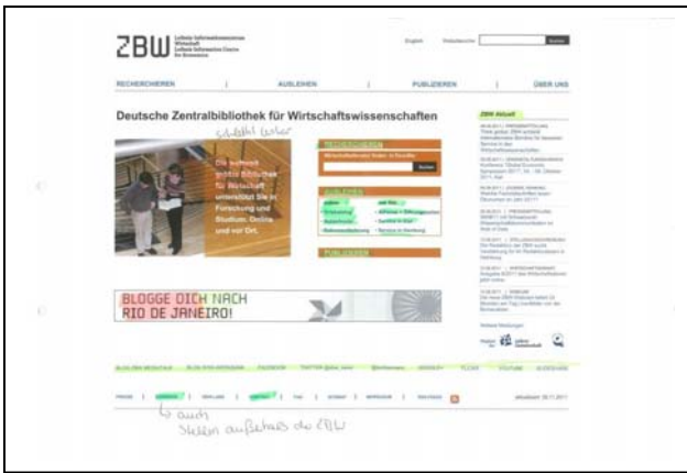
Figure 4. Typical example of the advanced scribbling