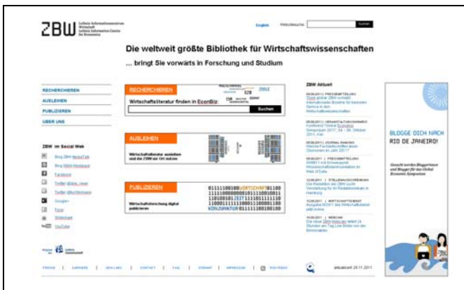
Figure 1. Design version A