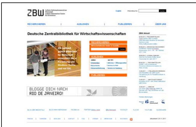
Figure 2. Design version B